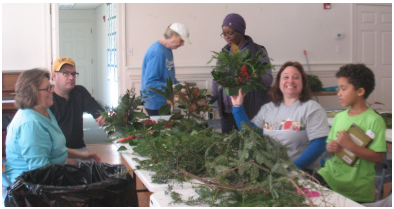
Thanks to all who helped decorate for Christmas!