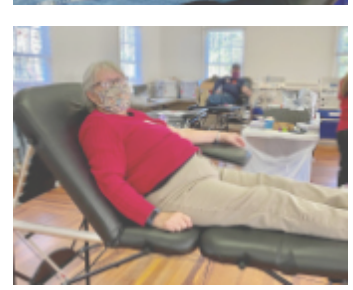
Save the date for February 23, 2021!